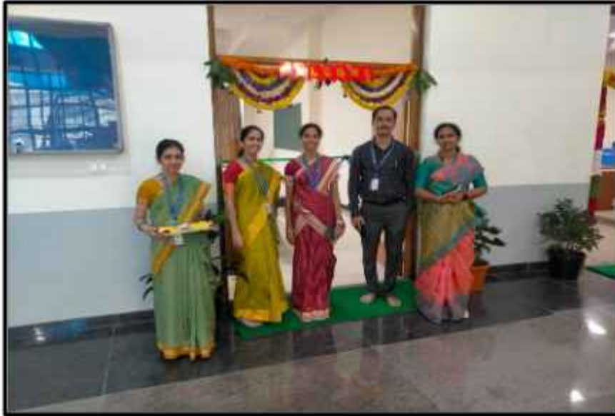
MCA New Floor Inauguration