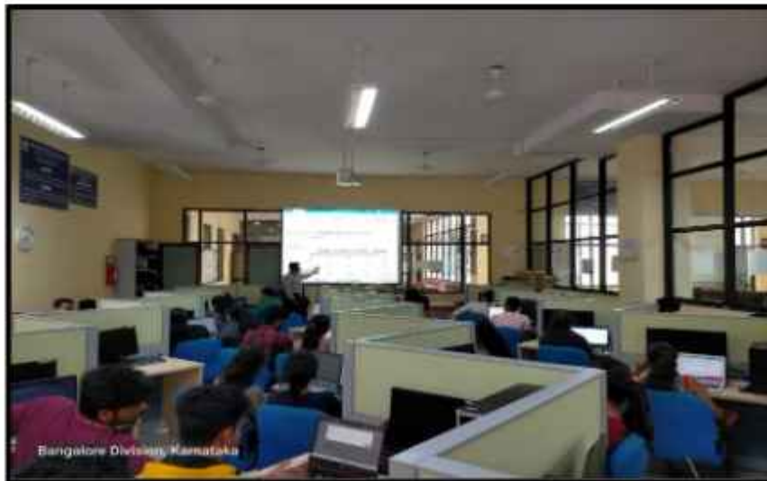
Skill Development Workshop session