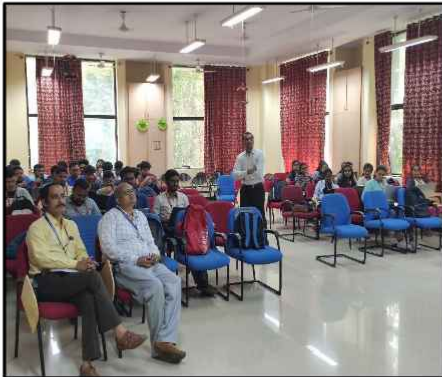
Hands-on Session on GitHub CoPilot