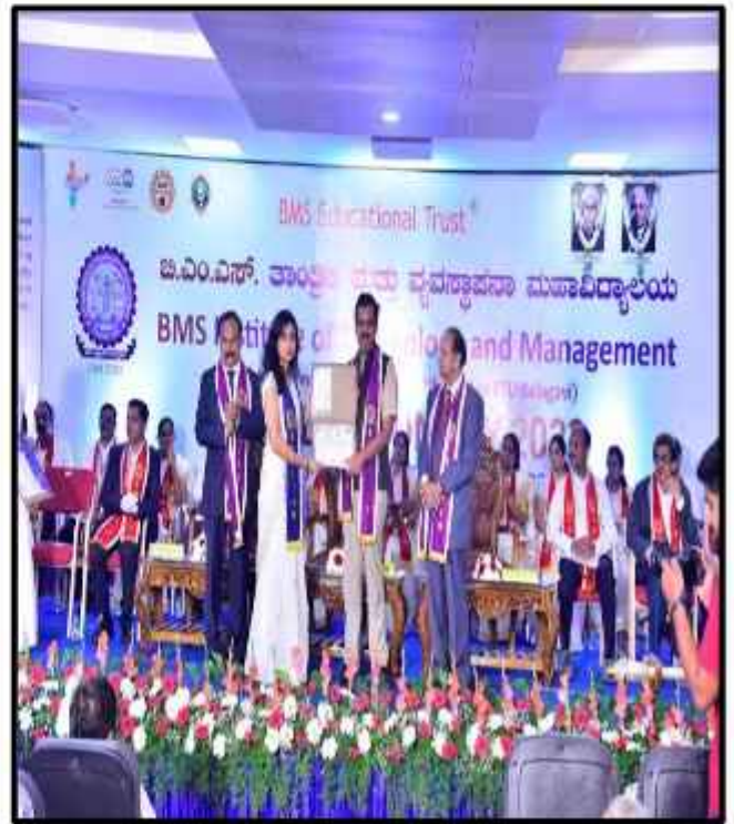
Graduation Ceremony for 2023 batch graduates