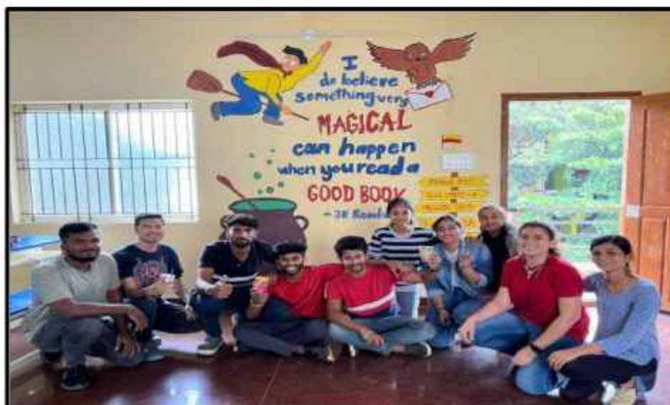
MCA Students at Moulana Azad Model School during ‘Paint a School’ event