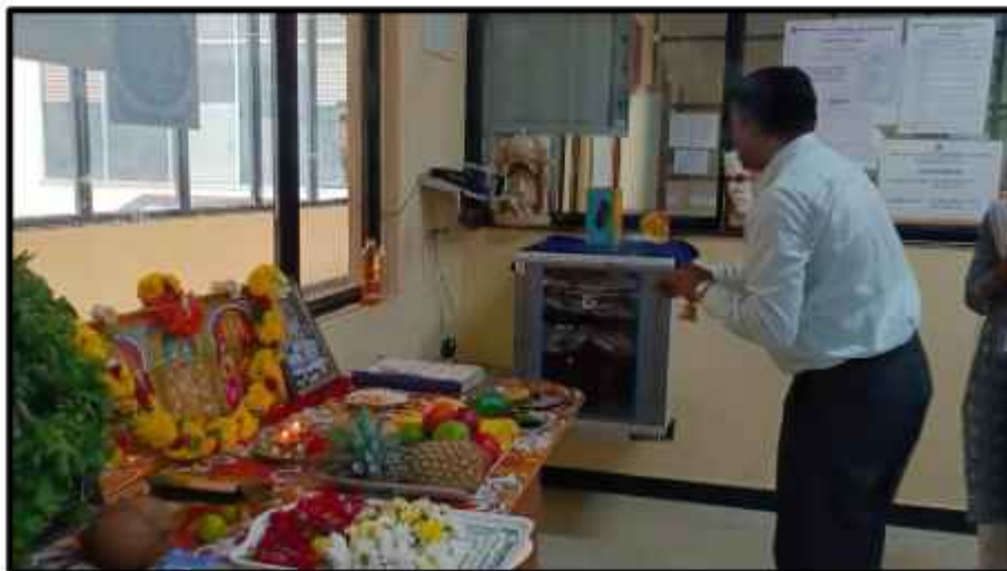
Ayudha Puja at Department of MCA