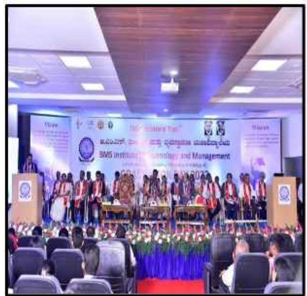
Ceremonial Band leading the Academic Council Members