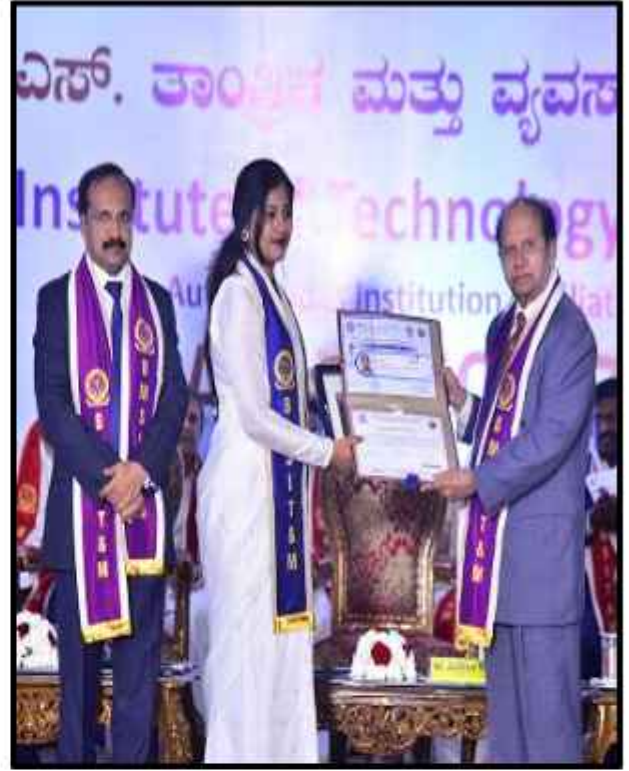
Rank Holders receiving the honor