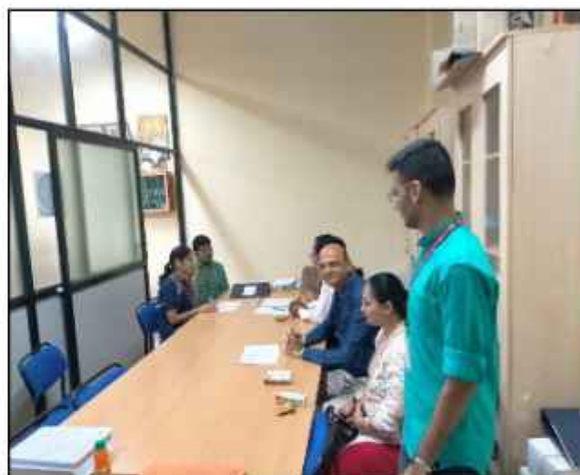
PTM at the Department