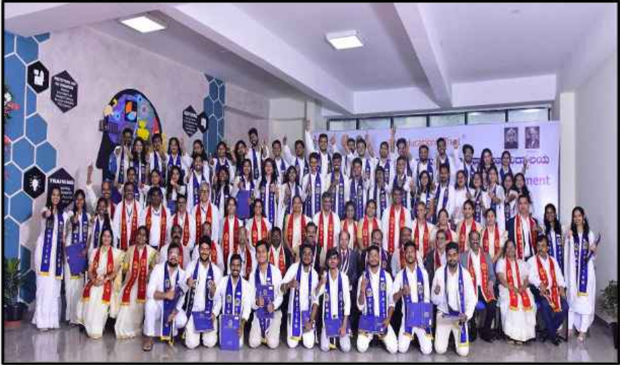
Graduates with the Academic Council Members