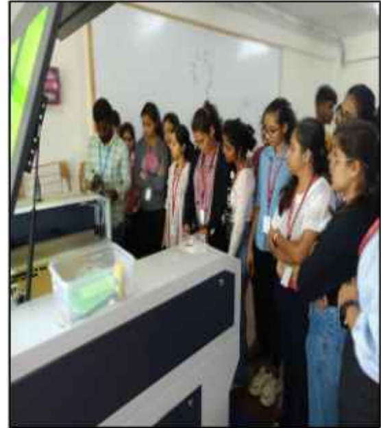
Industrial Visit to Atal Skill Lab at VIAT, Muddenahalli