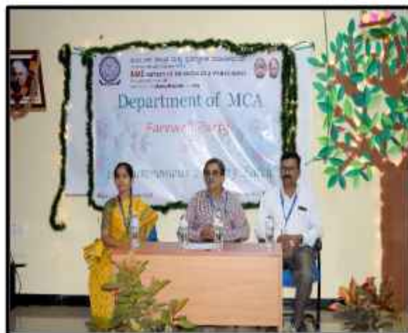
Farewell Day for 2021-23 Batch MCA Students